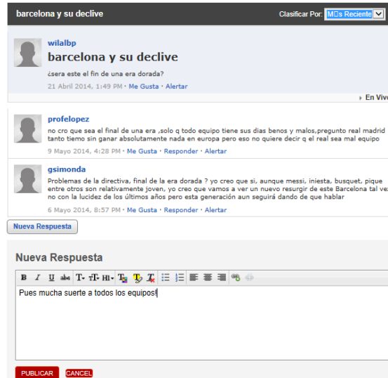
Fig. 3 Web Application Web using Comet with Grails