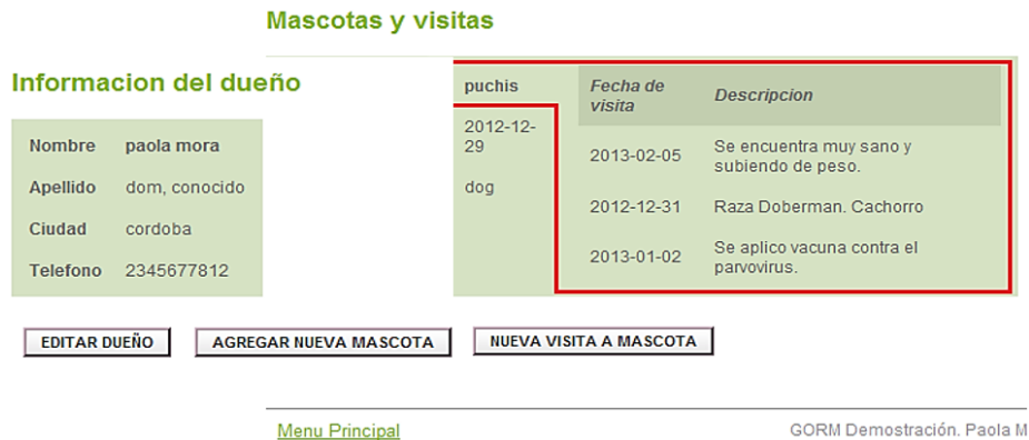
Fig. 4 Web Application using ORM with Grails

There are common problems with the development of Web-based projects such as: 1) developers frequently make the same mistakes in the development phase, which implies spend time and money, 2) spending huge amounts of time and money training new team members, 3) having difficulty with multi-person projects because each team member has his own way of doing things. In order to avoid these problems, this work intends to moti-